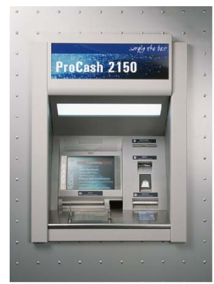
Wincor-Nixdorf Procash 2150xe ATM with deposit functionality

Equity Bank Kenya awarded Technology Associates the largest single-largest ATM contract in East & Central Africa comprising of 100 Wincor-Nixdorf ATM's covering cashdispensing and deposit functionality. With this rollout, the Equity ATM network will have 200 ATMs, all supplied and supported by Technology Associates. TA is proud to have played a key role in helping Equity implement its EFT payments platform on a turn-key basis and through a project we helped evolve since November 2003!. The bank has in excess of 750,000 customers processing over 20,000 transactions per day on an EFT switching infrastructure